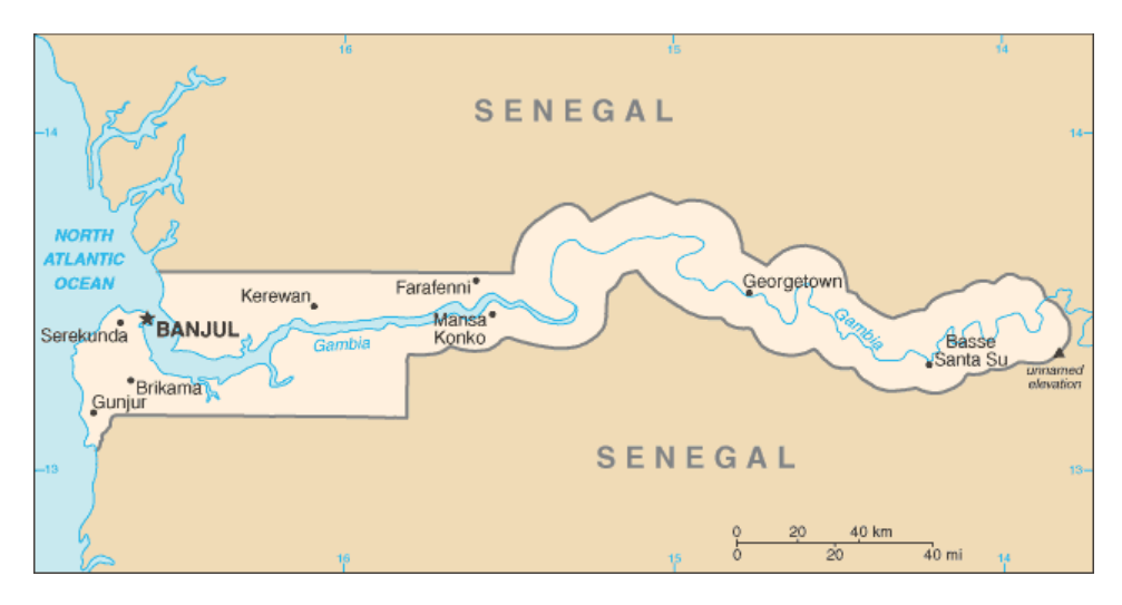
Figure 1: Map of The Gambia

The unique combination of climate and upwelling supports species and habitats that represent critical resources locally, nationally, regionally, and globally. The stretch from the Saloum Delta in Senegal, The Gambia River and the entire coastline of the Gambia, as well as the Casamance river system is one contiguous area that has regional biodiversity significance.