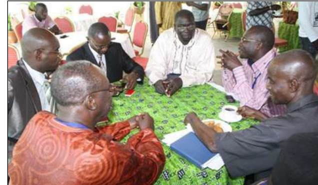
Figure 8: Group discussion