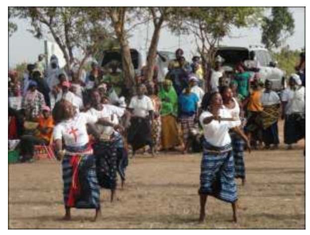
Figure 5: TRY annual oyster festival