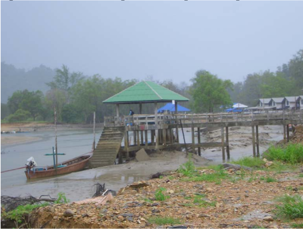
Figure 2. Low tide in Village 2. Note cages in background.