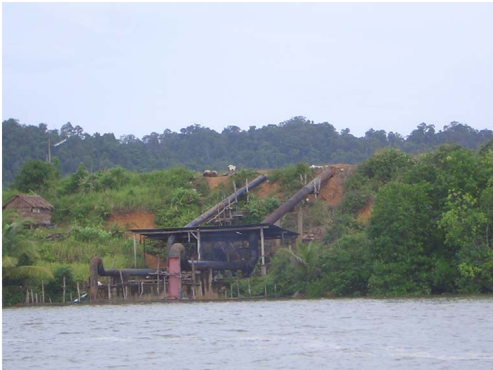
Figure 6. Pump station for shrimp farms. Most shrimp farms in Suk Samran are located above the tidal areas.