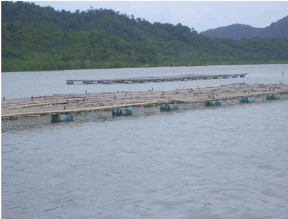
Figure 4. Mussel raft in Klong Naka

The effects of activities on the lands adjacent to Klong Naka should not have a significant effect on aquaculture in the estuary. The klong is located, in large part, within Lam Son National Park so development is restricted. Shrimp farms are located in the upper reaches of the mangroves and filled by pumping (Figure 6). Given the limited area occupied by these farms, their effect should be minimal on the estuary as a whole except for the escape of white shrimp. The increasing presence of filter nets (both stationary and motorized) is of much more concern.