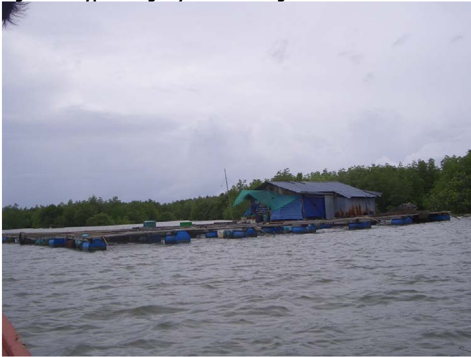
Figure 5. Typical cage system in Klong Naka.