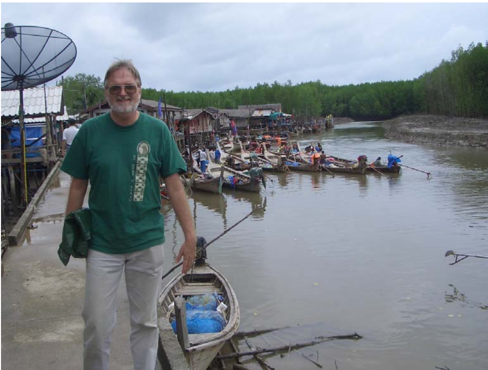
Figure 3. Klong Klui adjacent to Village 4. Note limited area for cages.