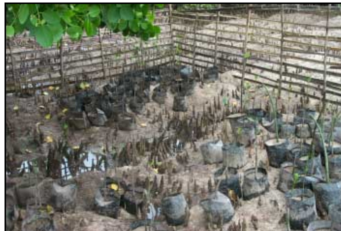
Mangrove nursery on Kinabohutan Island