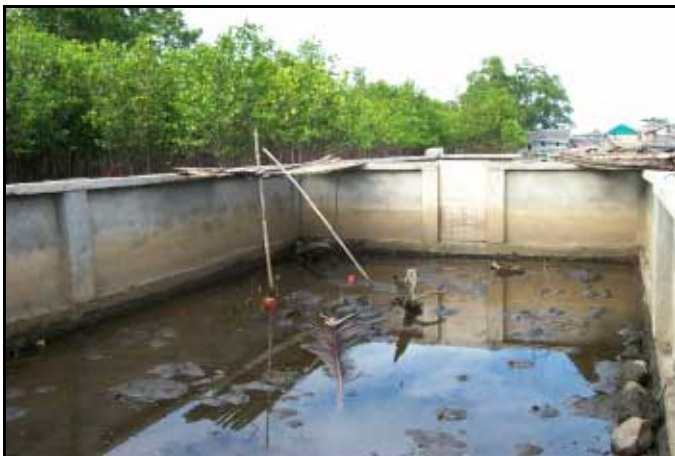
Crab fattening tank