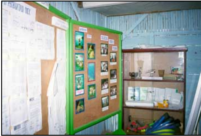
Displays inside the information center