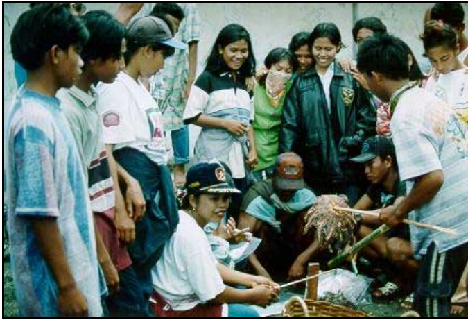
Crown-of-Thorns clean up