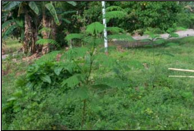
Agroforestry area with new seedlings planted