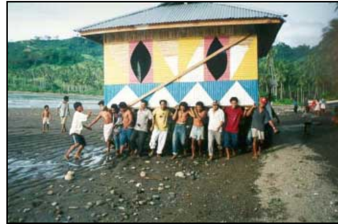
Information center moved from the erosion prone area