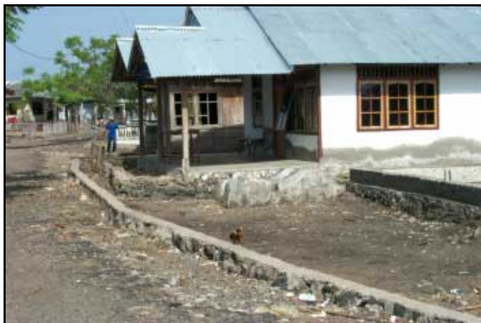
Road flood control dike