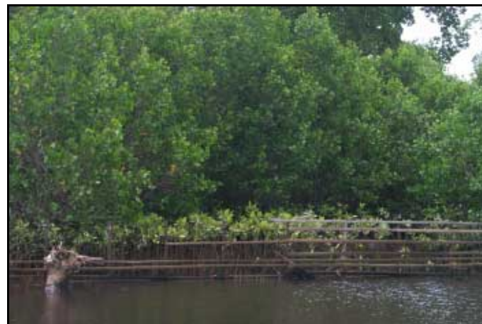
Mangrove reforestation area and fencing