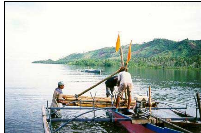
Marine sanctuary marker buoys being installed