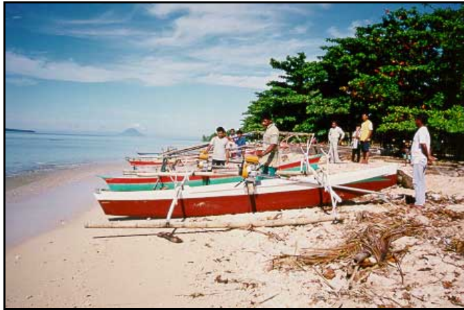
Boat engines obtained through the revolving fund