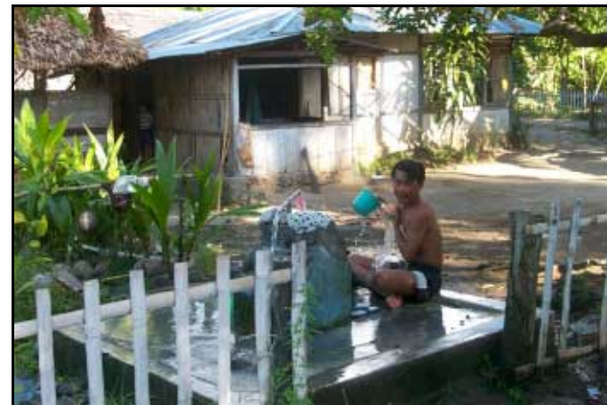
Water supply system and standpipe