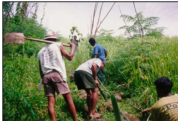
Agroforestry site being planted