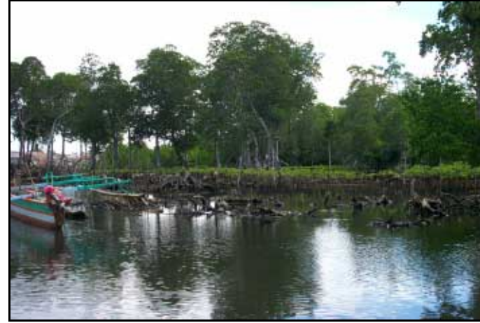
Mangrove reforestation area behind the village