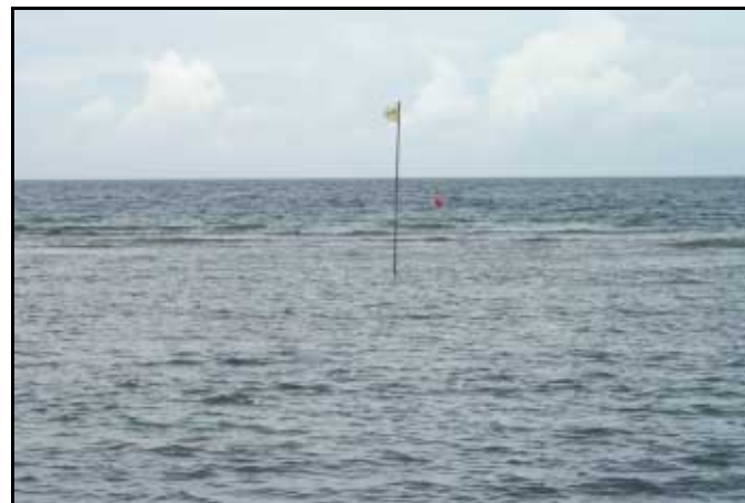
Marine sanctuary boundary marker