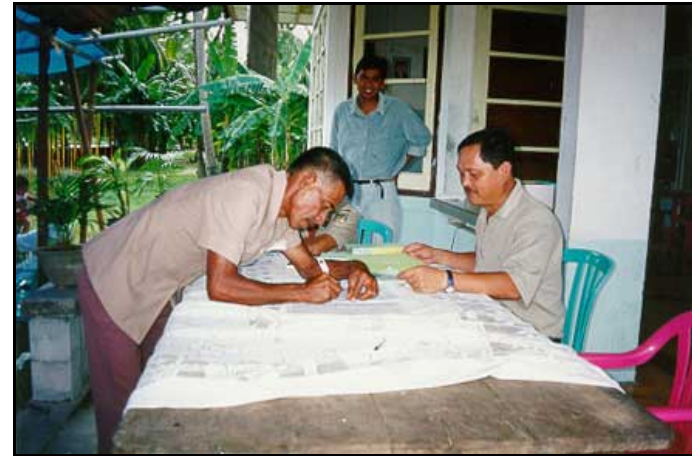
Certificates of title for land being signed and distributed