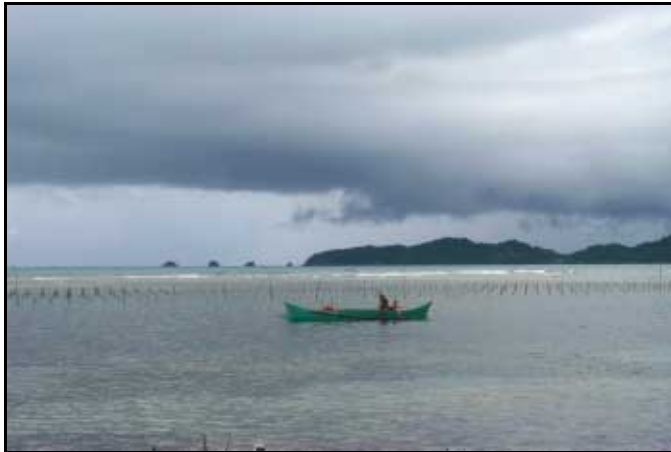
Mangrove planting on reef flat