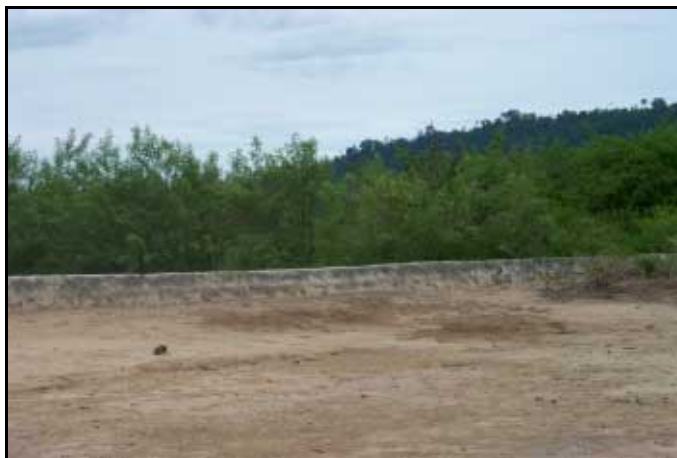
Flood control dike on Kinabohutan Island