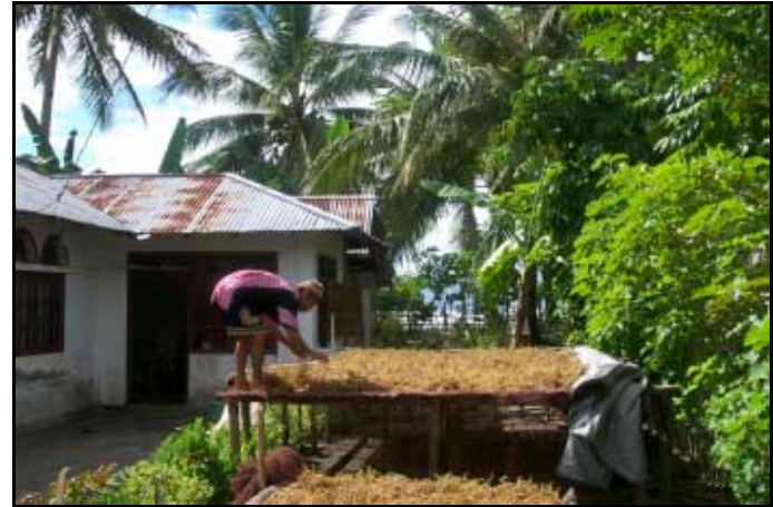
Seaweed harvest being dried