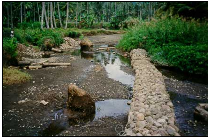
Erosion control dike