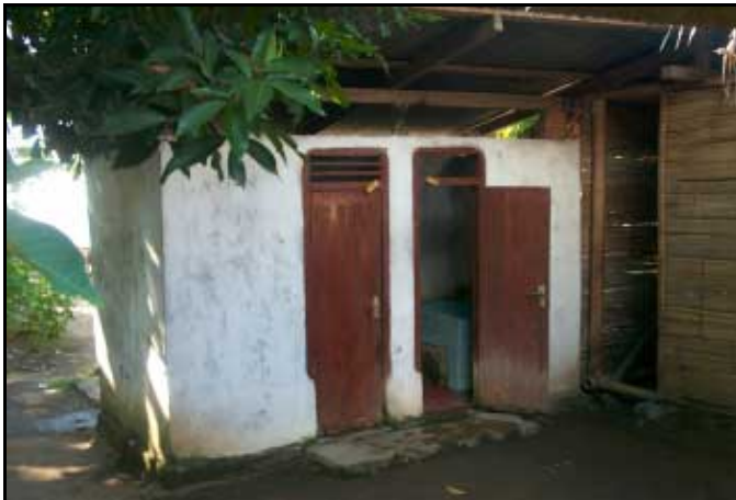
A bathing/washing/latrine unit