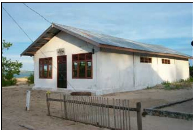
Information center in Tambun sub-village