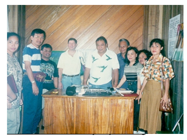
Training in coral reef monitoring.